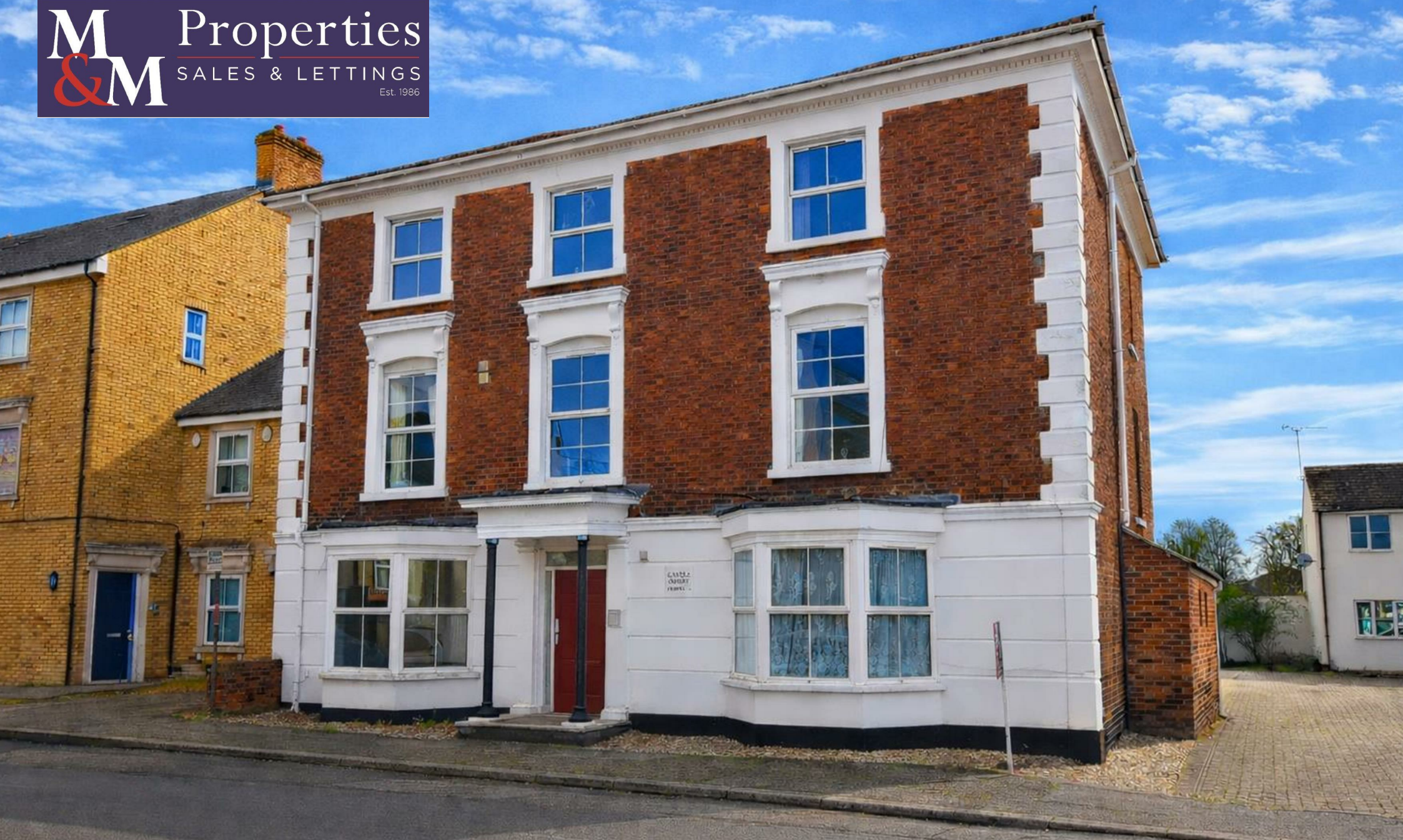
Castle House, Linslade, LU7 2RB